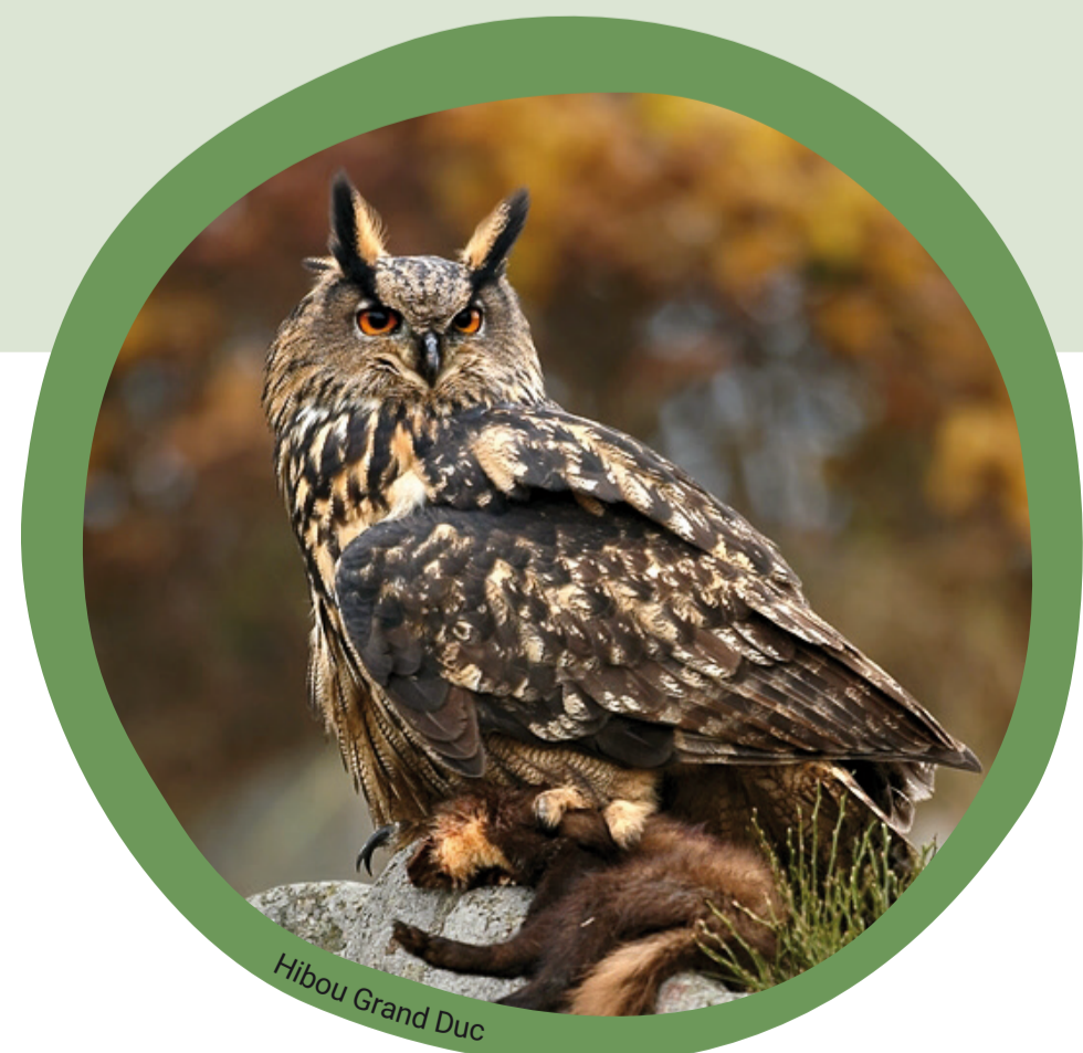
Hibou Grand Duc

As for the flora, the quarries host many rare plants, including local wild orchids that are regularly spotted and recorded.